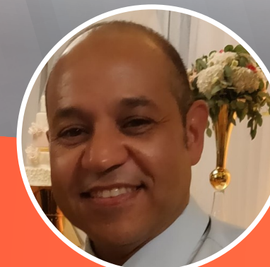
ICCIMS GENERAL CHAIR